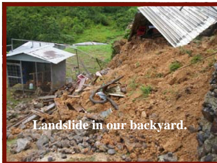
Landslide in our backyard.

We cannot begin to tell you how much we appreciate your prayers. Please continue to pray for our health and safety. For the last few months a volcano here in the Cartago providence has been very active. We have not gotten a lot of the toxic fumes or ash but on some days Lauri and Daniel's asthma is noticeably worse. Also, just last week our rock retention wall literally burst. This caused a landslide behind our house where our children normally play. Praise God that no one was there at the time and everyone is alright. The dirt and rocks have been dug up to put in a new wall. At the deepest point we had to dig away over six feet of clay and rock. A wall is being rebuilt but we know it is God's protection that is caring for us. We have no doubt that this is a direct reflection of your prayers! Thank you so very much!!