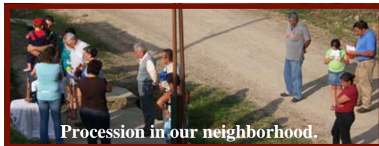
Procession in our neighborhood.

Praise God For Anniversaries! On April 18 th we celebrated our two year anniversary of the church in Cartago. Praise God for the growth we have seen in this church and most importantly in the lives of the people represented! God has been so good to us and we are thrilled that He is doing a great work in this city! On April 24 th we celebrated our fourth anniversary of the day we left the United States to come to Costa Rica! What blessings we have seen over these past years! Four years ago we started on what seemed like a long journey of learning the language and adapting to life here; however with God's help we learned not only the language but also the culture! Since then, by the grace of God, we have seen many souls saved, lives changed, taught in Bible institutes, helped with children's homes, taught English Bible studies, served in two churches and now we have started yet another church from scratch, in an area we were told it could not be done. In our power it couldn't but, thankfully, in God's power it can!